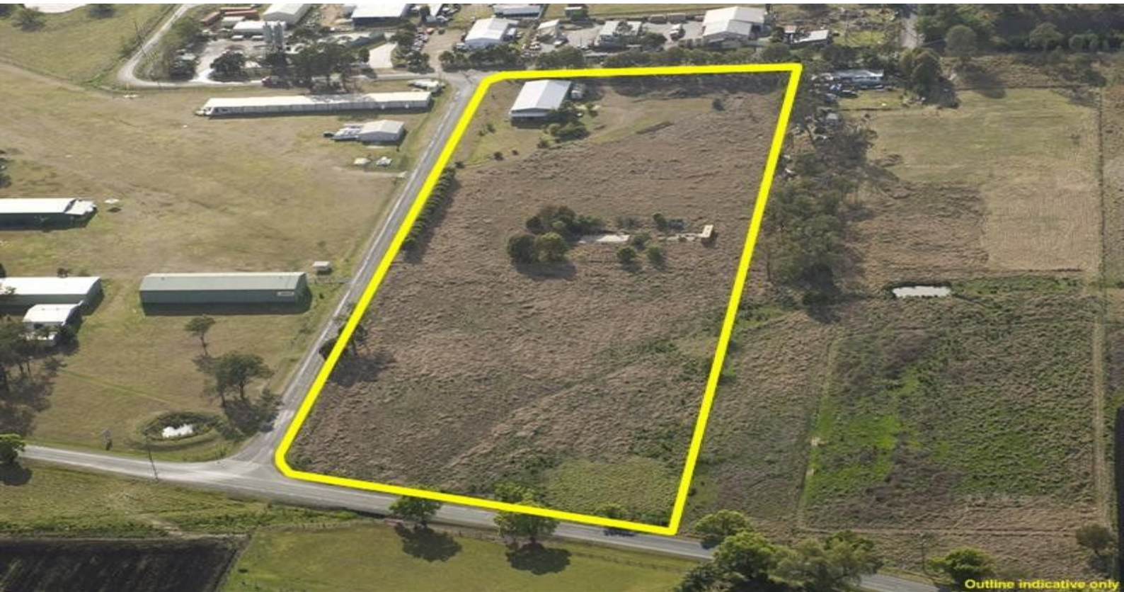
Outline indicative only