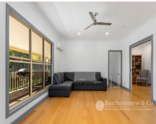
4 Jensen Street ARATULA, QLD