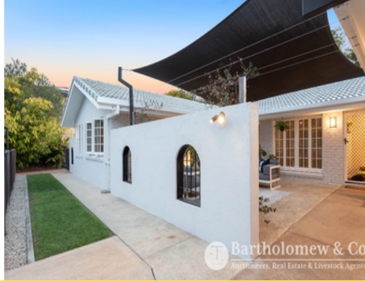
39 Macquarie Street BOONAH, QLD