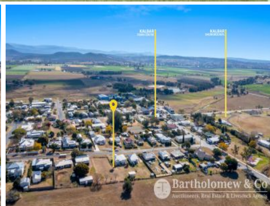
24 Ann Street Kalbar, QLD